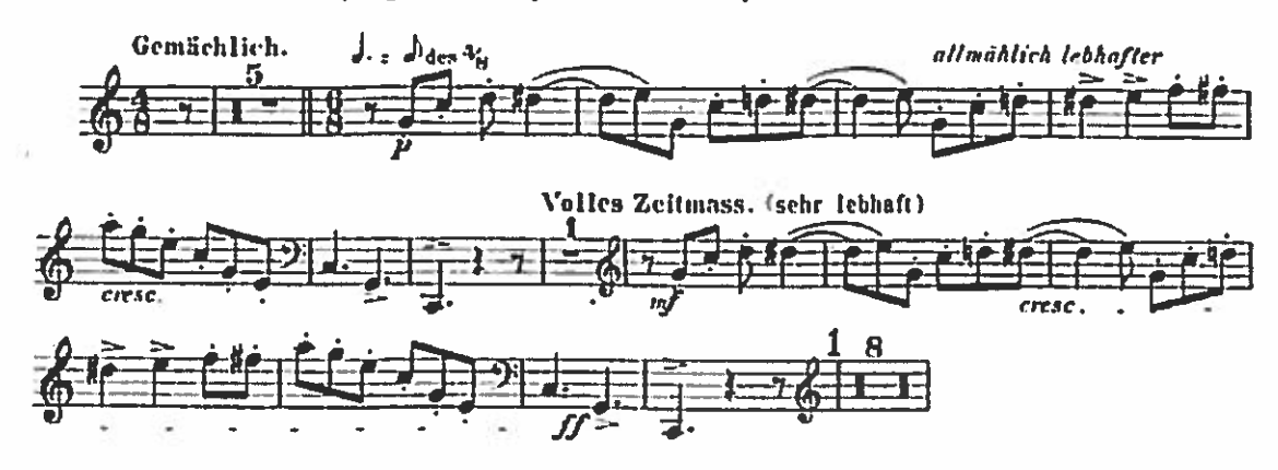
Mendelssohn—Nocturne from "Midsummer Night's Dream" Excerpt 2 Horn I in E

Strauss—Till Eulenspiegel's Merry Pranks Excerpt 1