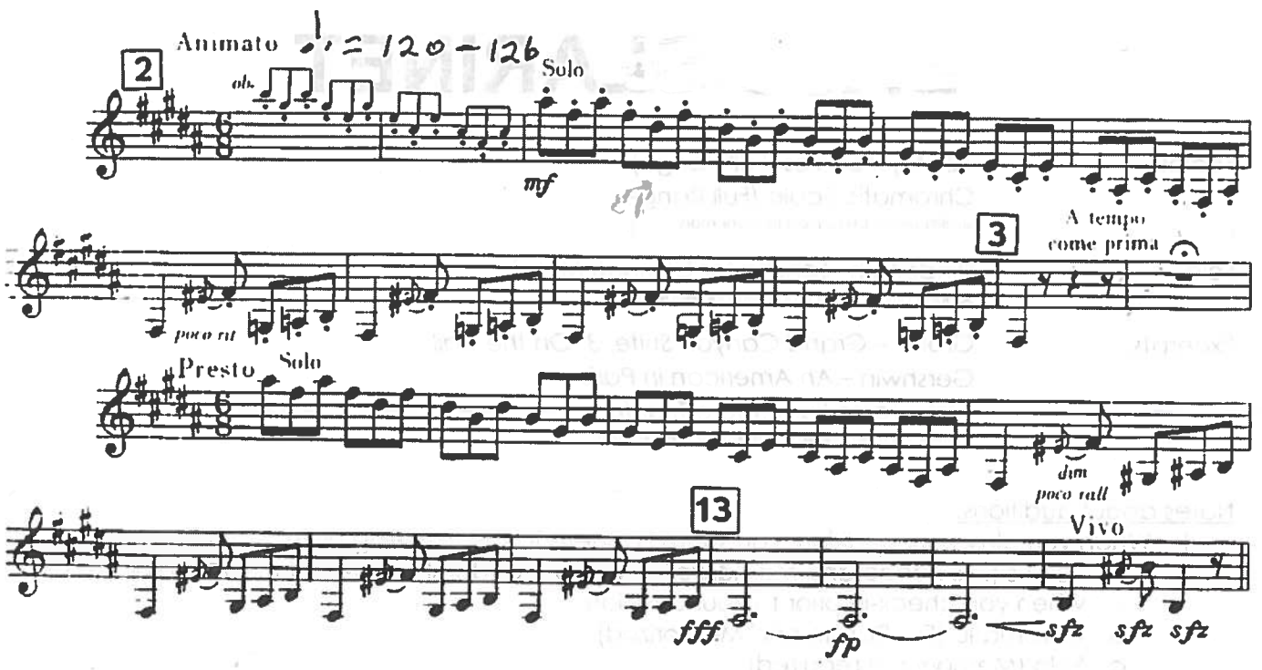
Copyright 1932 renewed 1960 RUBBINS MUSIC CORPORATION New York Used by permission