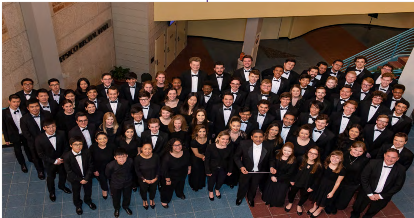
The TCU Symphony Orchestra's was featured as the College Honor Orchestra at the 2019 TMEA Annual Convention in San Antonio, where they brilliantly performed Shostakovich's Symphony No. 5 .