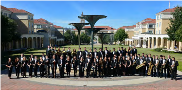
The TCU Wind Symphony performed at the CBDNA convention in Tempe, Arizona in February 2019.