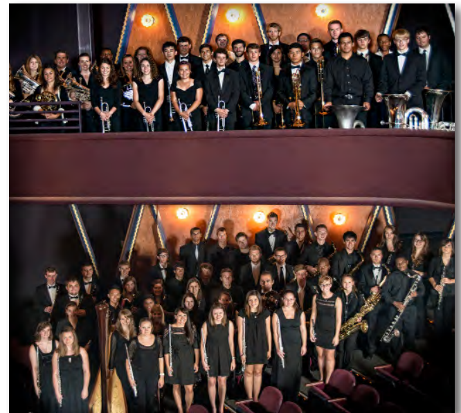
The TCU Symphonic Band performed at the CBDNA Regional Conference at the University of Arkansas in March 2014.

The Texas Christian University Symphonic Band has developed a tradition of outstanding performances and recordings of high quality repertoire. Members include a mixture of music majors and additional fine musicians from across the TCU campus.