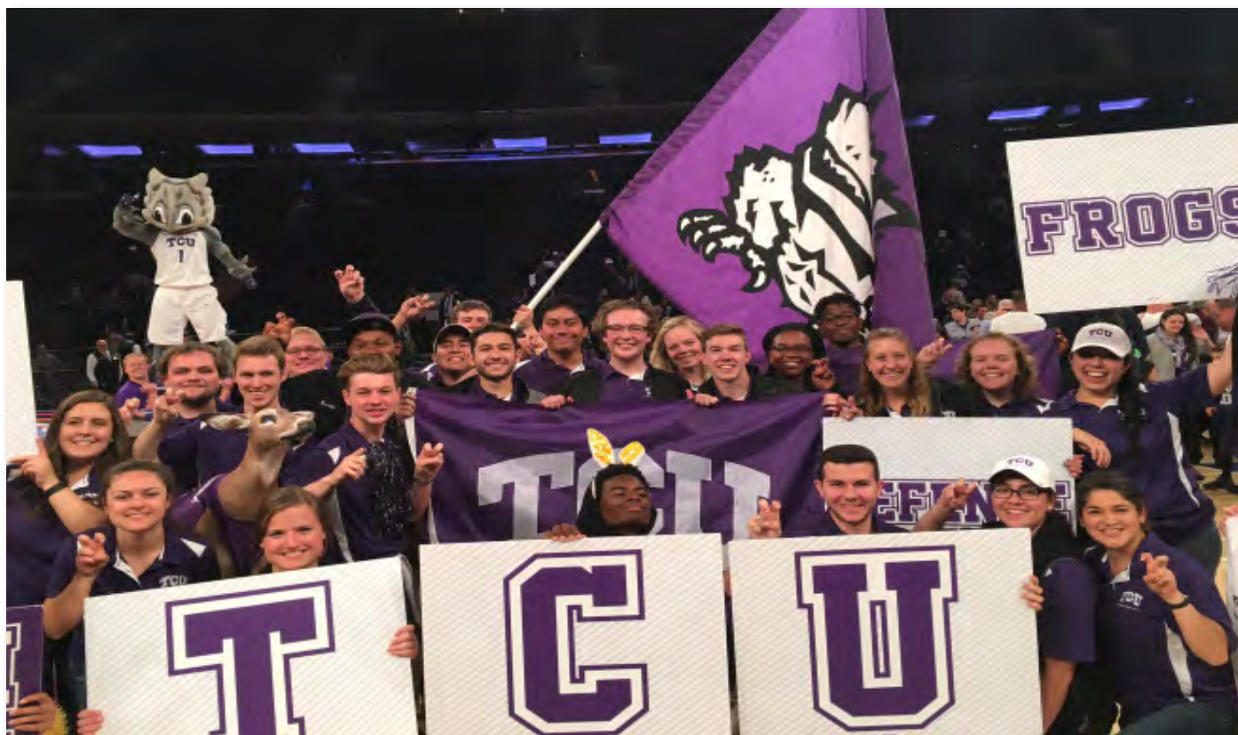
The TCU Basketball Band celebrates at Madison Square Garden in New York City during TCU's Men's March 2017 Basketball Championship NIT-winning performance.